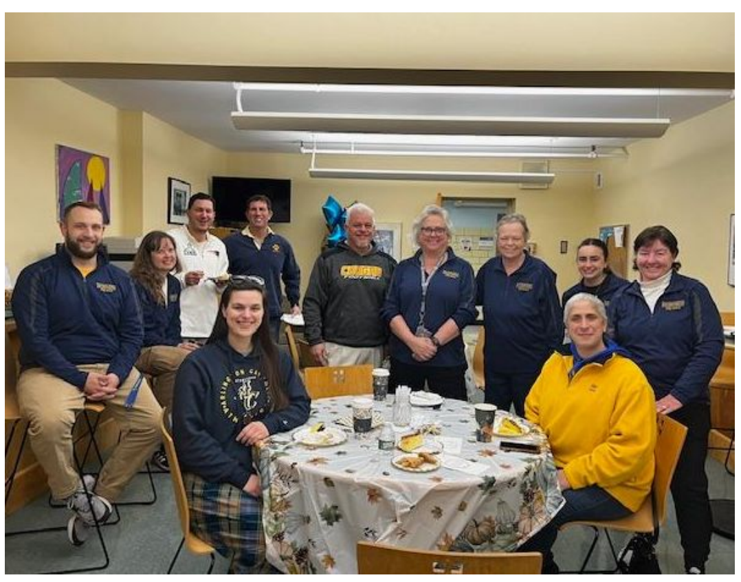
Thanksgiving at the Salvation Army

The AC Rotary Interact Club had a great time sharing stories, food, and