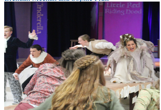
ACDC performers warm up before the show