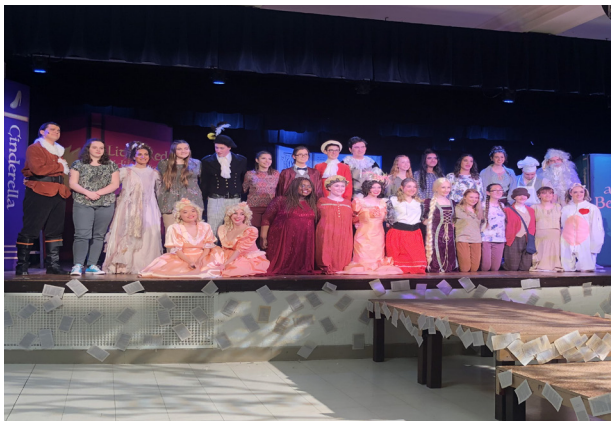
The Cast of "Into the Woods"