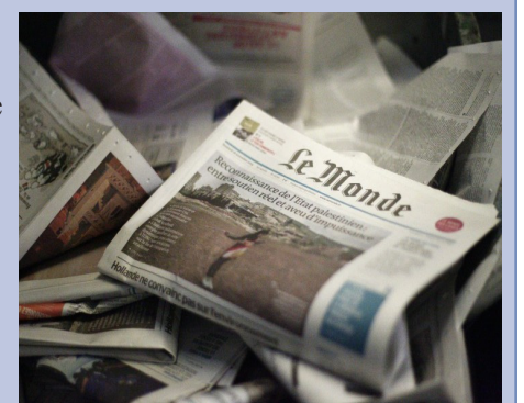
Le Monde is a French afternoon newspaper which has been in continuous publication since 1944.